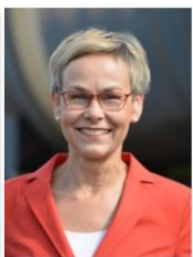
International Rail Competence Network KNRBB