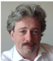
Public Transport Expert Axel Kühn Karlsruhe (Germany)