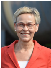
International Rail Competence Network KNRBB